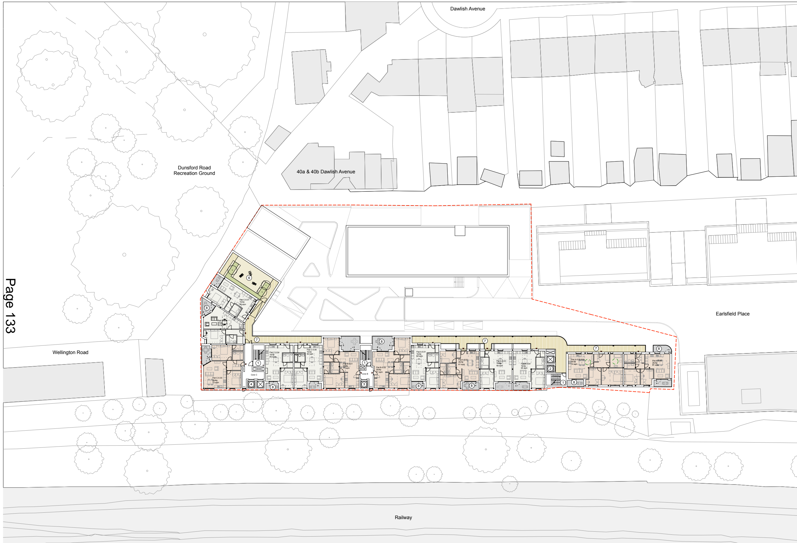
Fifth Floor Plan scale 1:500@A3